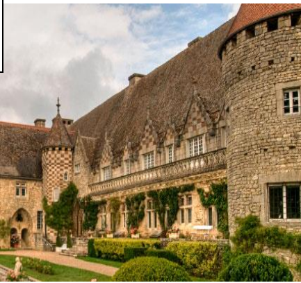
We will spend five nights at the Hattonchatel Chateau, outside of Verdun.