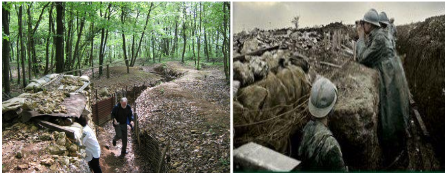
Preserved Trenches, St. Mihiel Salient

Lunches and dinners listed as “on own” are suggestions of Mike Grams for places to dine, but passengers can do what ever they wish for these meals. Meals included in tour cost are indicated next to date: B-Breakfast, L-Lunch, D-Dinner.